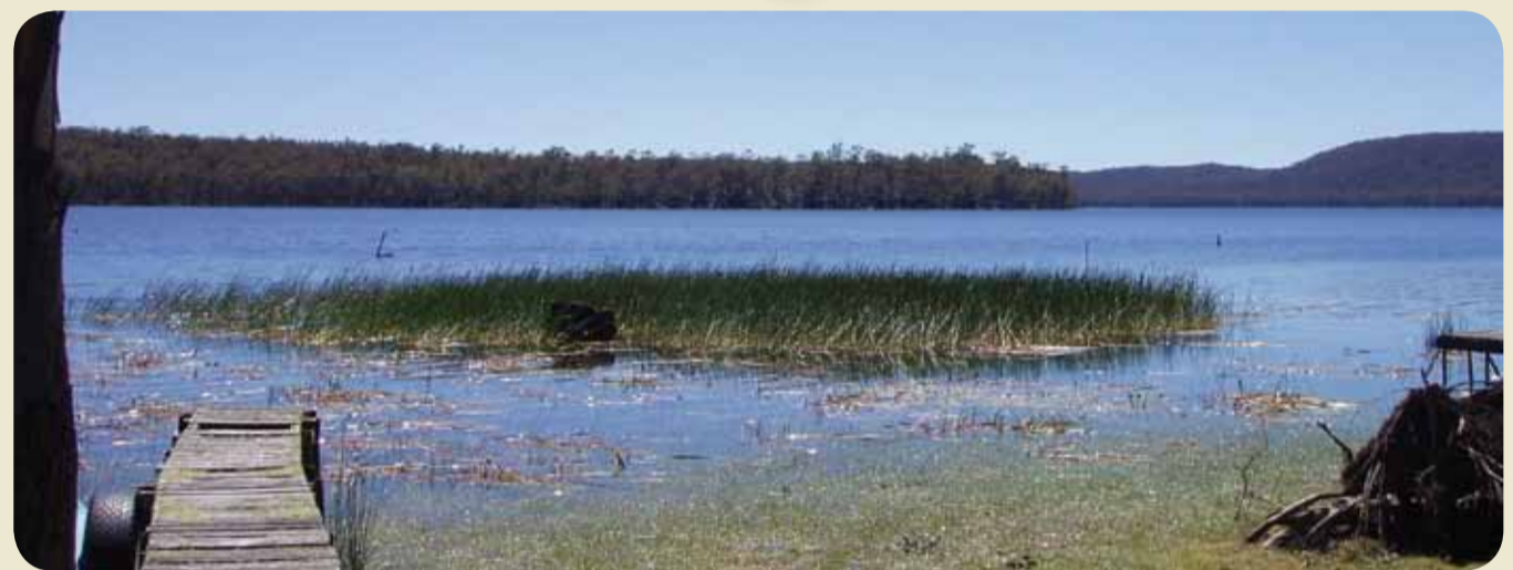
Brown and Rainbow trout Brook trout